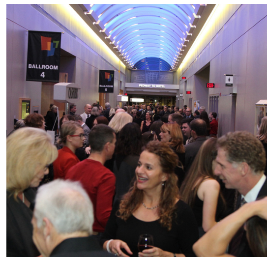
Aalbers @BrianLibroCU - 25 Nov 2015 Passionate people ready to kick off #PCIA15! Thanks to @PillarNetworking event.