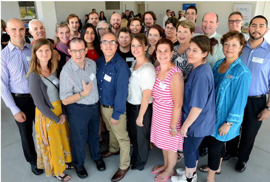
Celebrating Our 2015 Finalists